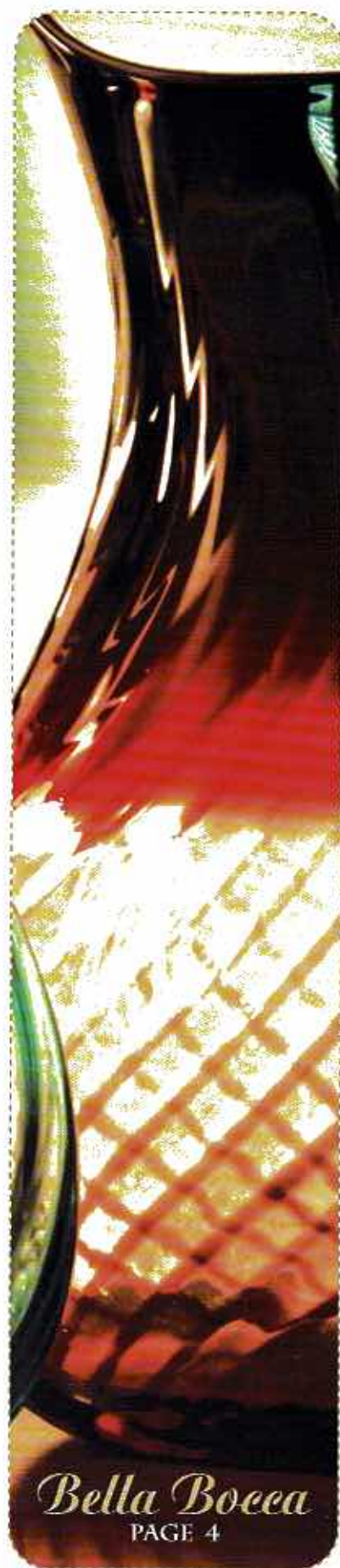
Bella Bocca PAGE 4