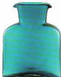
- SEABREEZE -