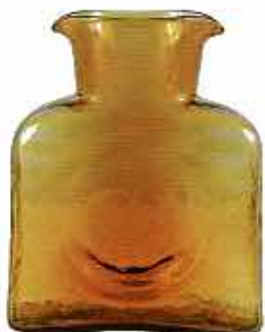
- TOPAZ -