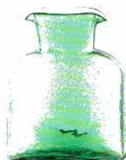
- SPRING GREEN -