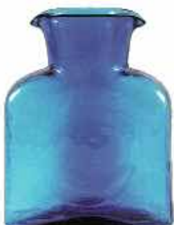
- ELECTRIC -