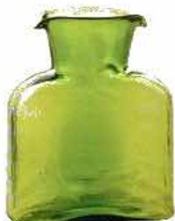
- KIWI -

**384 RUBY ONLY AVAILABLE APRIL - OCTOBER