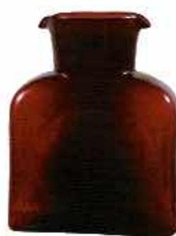
- RUBY** -