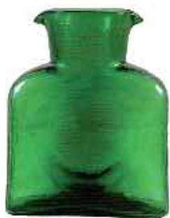
- CLOVER -