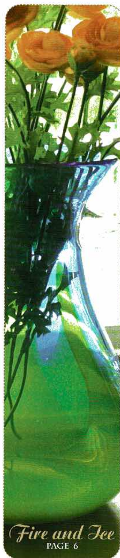
Fire and Ice PAGE 6