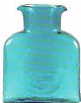
- OCEAN BLUE -