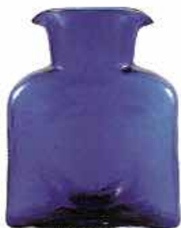
- COBALT -