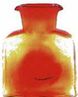
- TANGERINE -