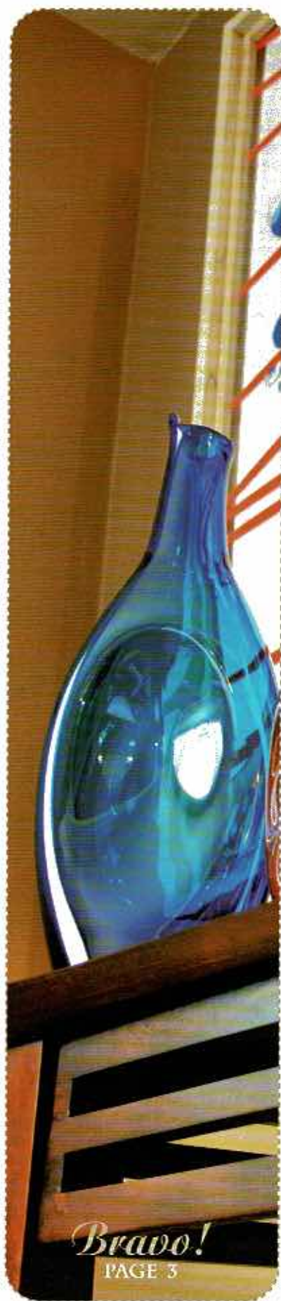
Bravo! PAGE 3