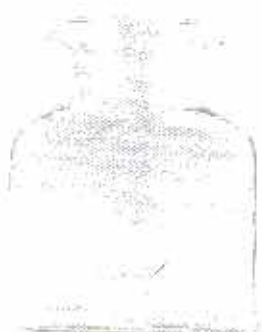
- CLEAR -